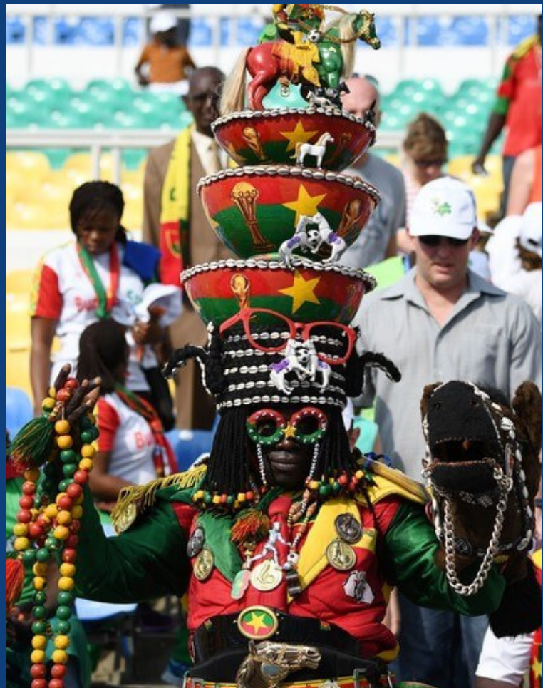
A Burkina Faso supporter poses ahead of the 2017 Africa Cup of Nations quarter-final football match between Burkina Faso and Tunisia at the Stade de l'Amitié Sino-Gabonaise in Libreville on January 28, 2017.

Because match fixing does not just affect the immediate stakeholders, it also trickles down as disappointment to fans, it should be a problem for all of us to fix. In a report by Thomson Reuters, match mixing was dubbed as the biggest threat in the 21st century. However, it could also be our biggest chance to solve something big, together. We cannot let our players lose out on the one thing that should be fulfilling them.