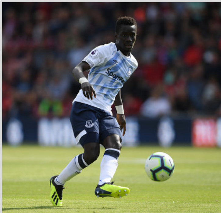
Idrissa Gueye of Everton and Senegal

Over the weekend, we once again saw Gabon’s Pierre-Emerick Aubameyang leading the line for the Arsenal. Before that, in midweek, the Gabonese captain had two delightful chances of extending his lead at the top of the scoring charts and required perhaps the world’s best goalkeeper to deny him twice after two wonderfully worked shots. Over the weekend, he was also not on the scoring sheet but put in a solid striker performance, eventually serving up the only assist of the match as Lucas Torreira scored the only goal of the game.